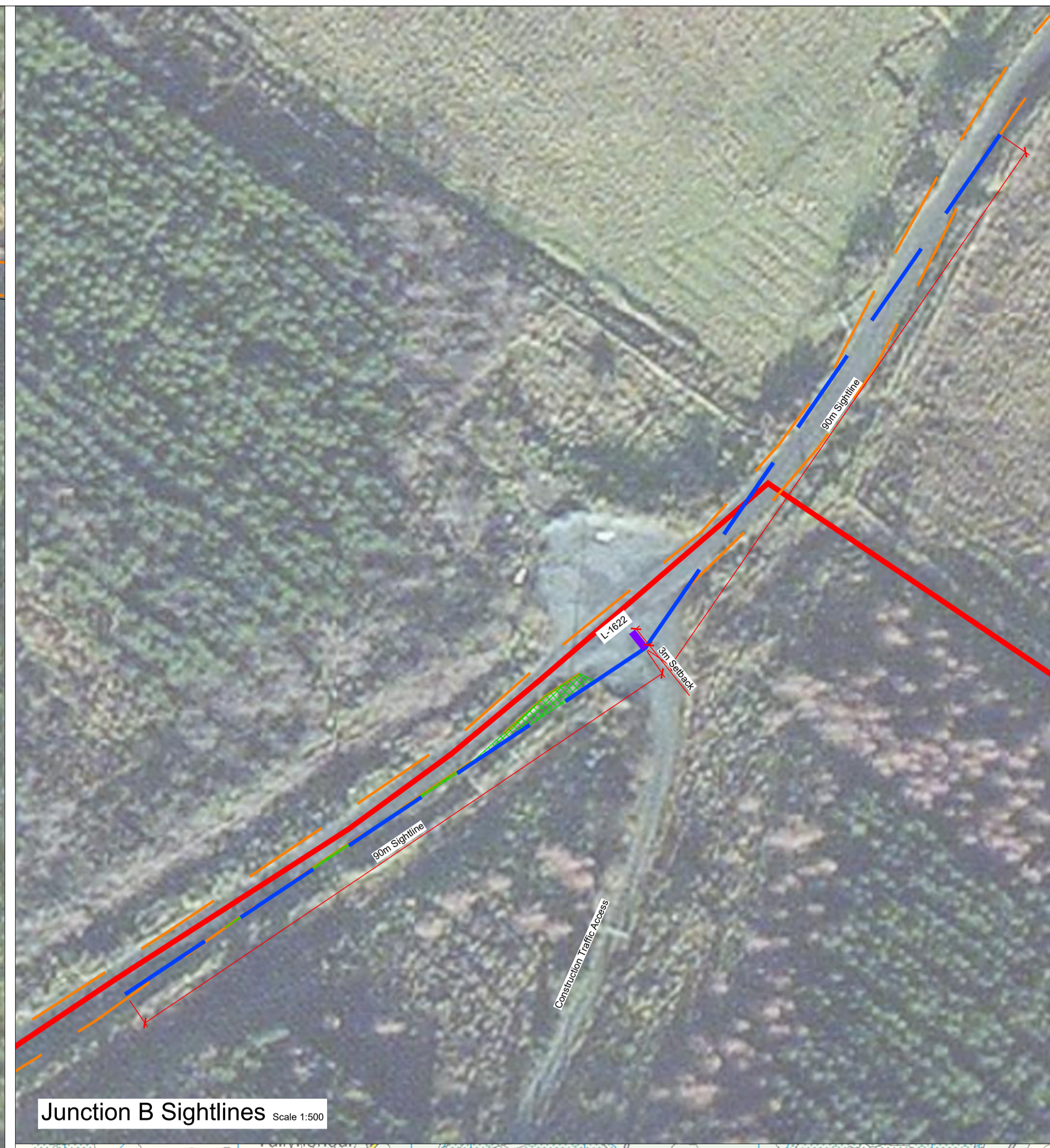
Junction B Sightlines Scale 1:500