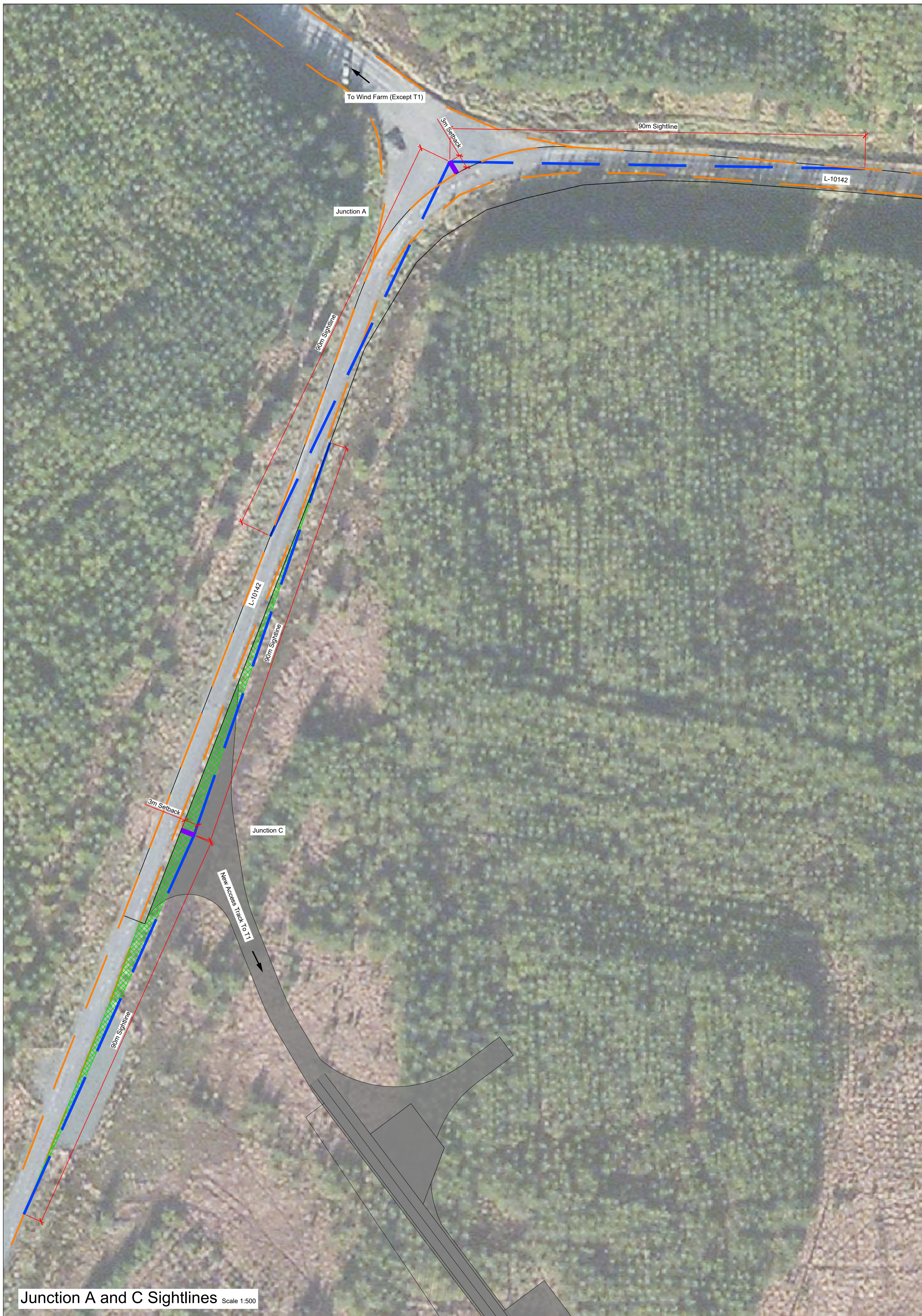
Junction A and C Sightlines Scale 1:500